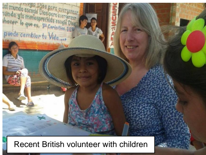
Recent British volunteer with children

Later in the year, perhaps for my "birthday edition", I hope to list all of the many incredible things that have been achieved, thanks to your help.