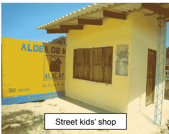
Street kids' shop

We have now supported fourteen adolescents through vocational training, equipping them with a range of useful skills that will significantly increase their job prospects and self-esteem.