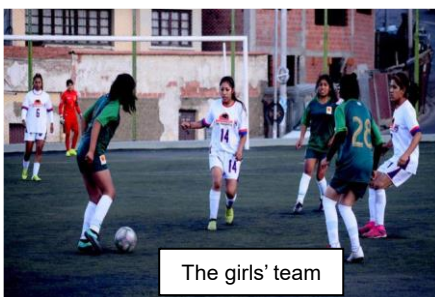
The girls' team

“[...] street children face various injustices and are exposed to abuse by social protection systems that do not cover them due to a lack of identity papers. When they reach adulthood, a lack of identification documents and birth certificates proving their identity and age further complicates their entry to work in the formal sector, enrol in education and access social protection aid. Ensuring that every street child can access their birth certificate has to be part of multidisciplinary efforts to end child labour.” (Consortium for Street Children 2021)